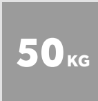
BALE WEIGHT CARDBOARD