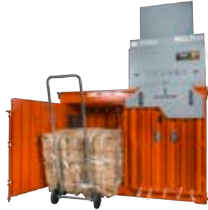
Multiple strap choice to meet both the demands of the material and tough handling requirements.

Whilst the baler compacts the material in one chamber, the other is open and ready to be fed with more material!