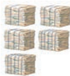
We are unique in offering cross-strapping on a multichamber baler. The bales are secured under pressure with 2-6 straps depending on the material and handling requirements for the finished bales.